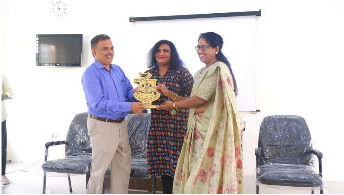
Faculty, scholars and students attended the session.