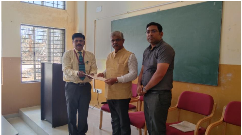
Post Graduate Centre, Suvarnangotri, Chamarajanagara