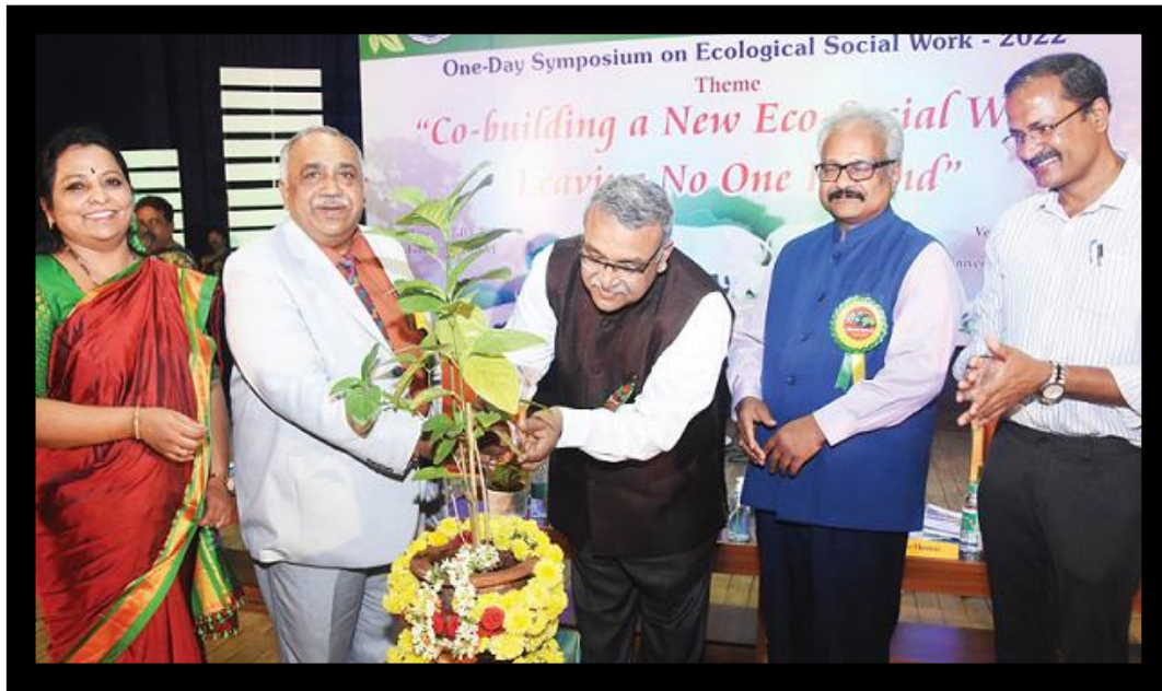
Inauguration by Watering to the Plant