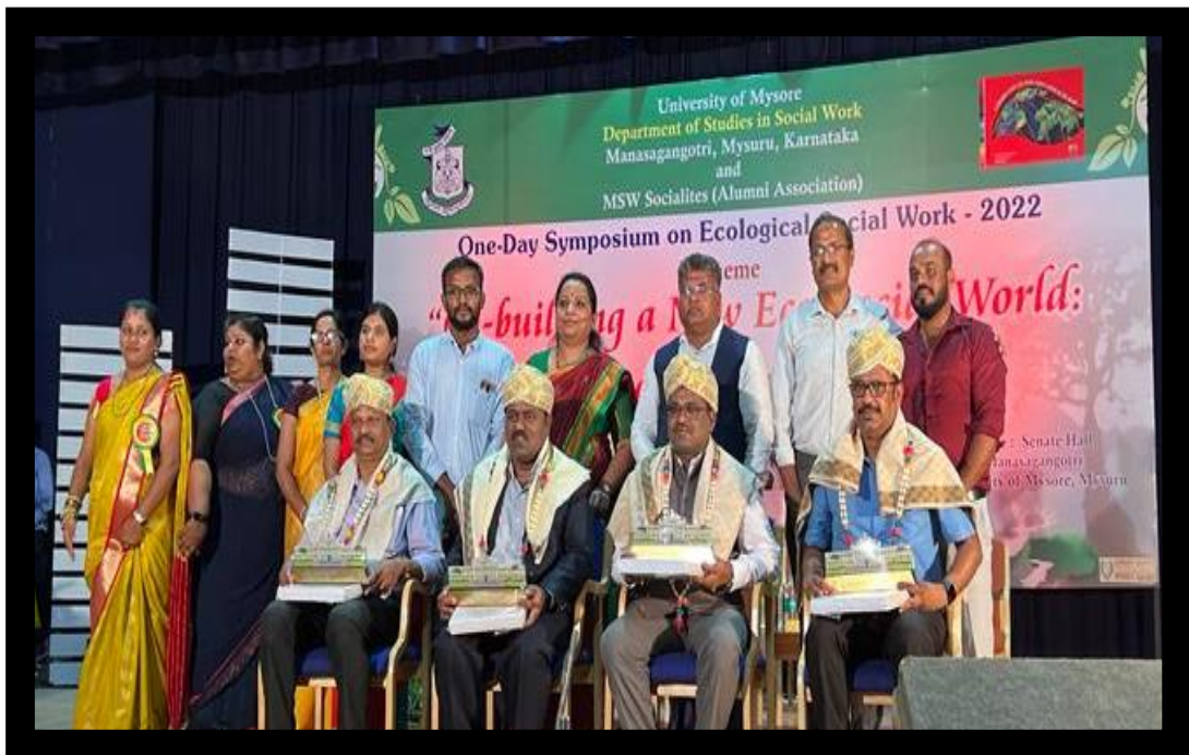
Honouring Guests in Valedictory Session