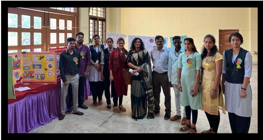
Participants from the various Colleges