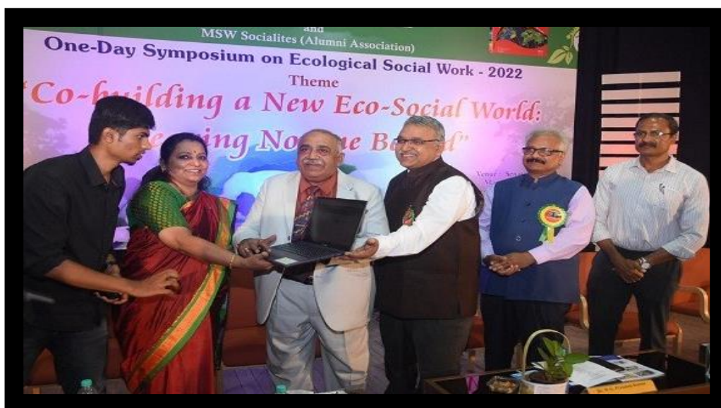
Journal Website Launching by the Elites

The second part of the event is the website launching and felicitation of old students who got placed in different public services in state and central Government departments. The 'Asian Journal of Professional Social Work' a new e-journal collectively published by the Department of Studies of Social Work and the MSW Socialites (An Alumni Association of Social Work Department) has launched the website titled www.ajpsw.com by the presented elites and addressed the gathering and request all professional of the social workers to contributes quality research works. The e-journal is published in two volumes in a year whereas, the teachers, scholars, students and social work partitioners may publish.