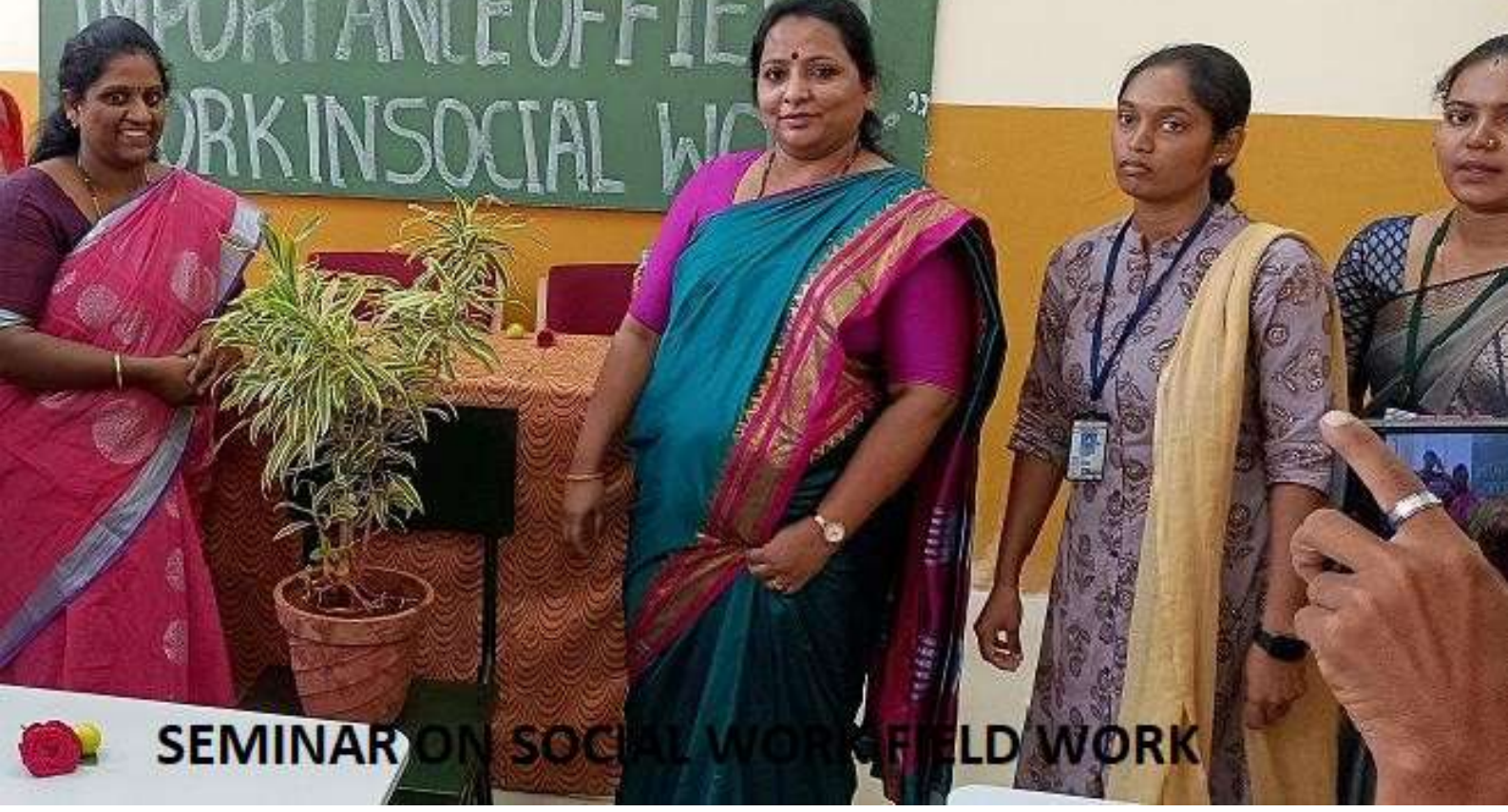
SEMINAR ON SOCIAL WORK FIELD WORK

ON "IMPORTANCE OF FIELD WORK IN SOCIAL WORK"